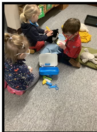
Vet role play.