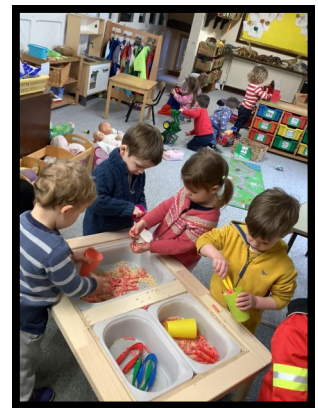
Exploring the sensory tray.