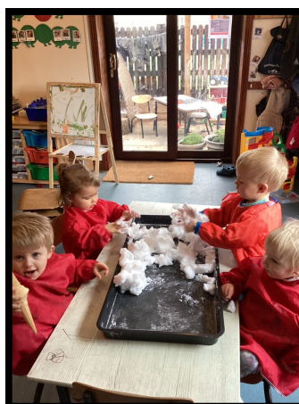
Ice cream sensory tray.