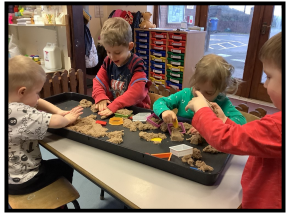
Sensory shape tray