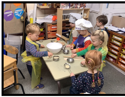
Cooking up some tasty treats.