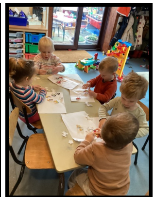
Chinese New year crafts.