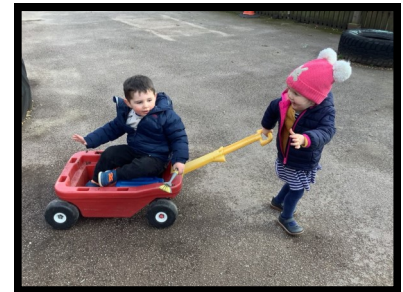
Fun with friends in the fresh air.