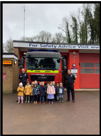
Trip to Newent Fire Station