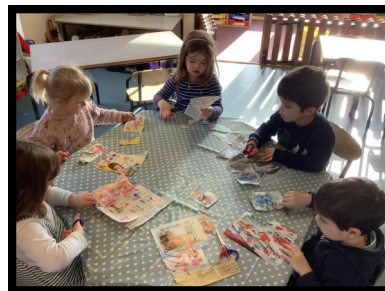
Practising our scissor skills.