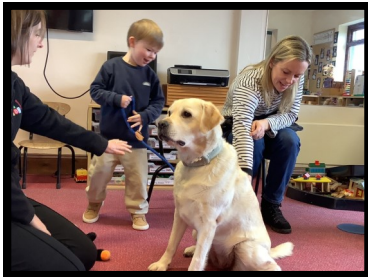
Vet with Lola the dog