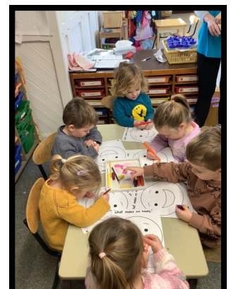
Decorating our Happy faces.