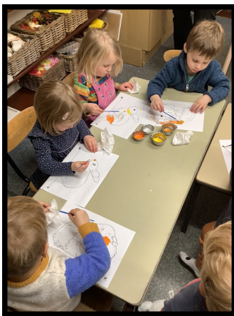
Creating our Rabbit and Guinea Pig pictures.