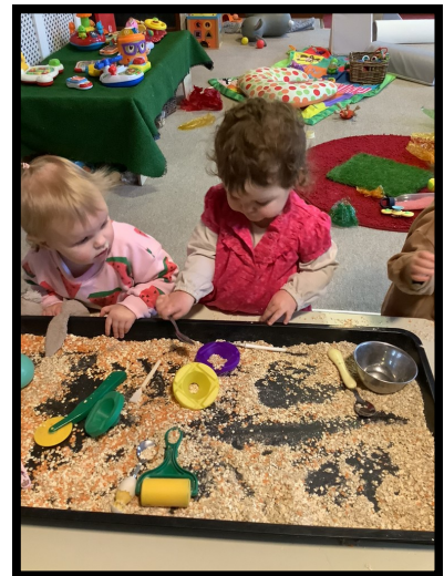
Scooping and mixing