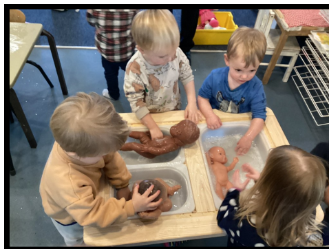
Washing the babies.