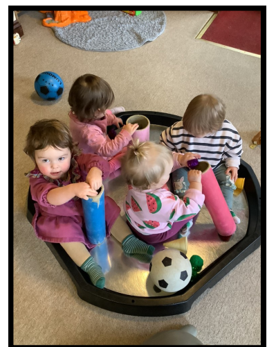
Fun with balls and tubes.