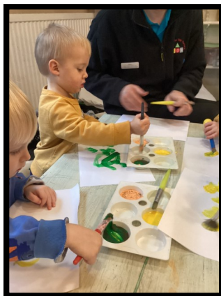
Painting using fragranced paint