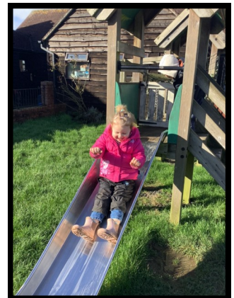
Ready, steady, go!