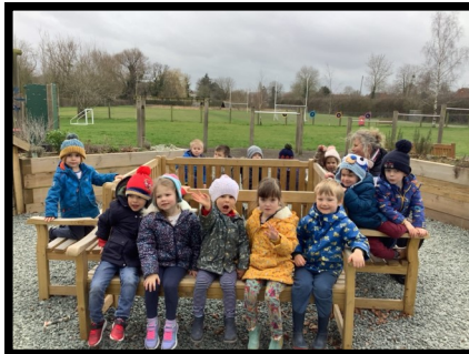
Visit to Eldersfield School