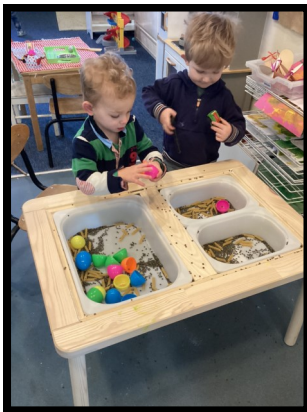
Exploring the sensory table