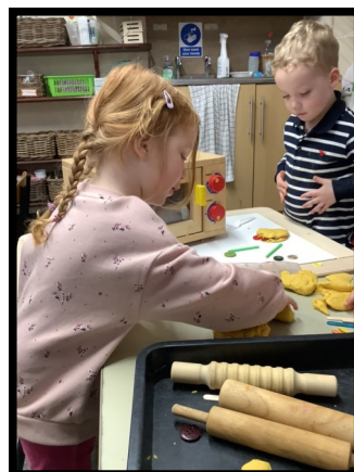
Getting creative with the playdough.