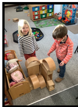
Creating structures together.