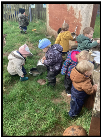
Lots of fun in the Mud Kitchen