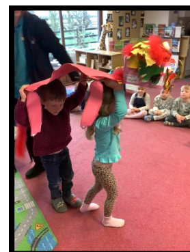
Celebrating Chinese New Year.