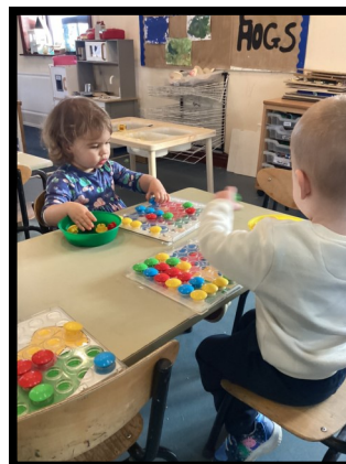
Creating shapes with the large mosaics