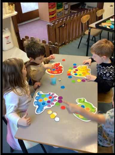
Fun with shapes.