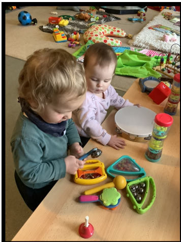
Exploring the musical table