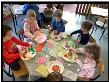
Creating our circle collages