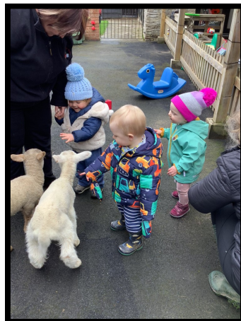
Snowy and Browny came to see us.