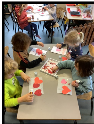
Creating Valentines cards.