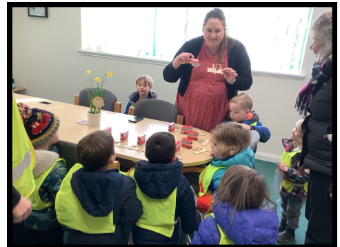
Trip to a Printing Factory