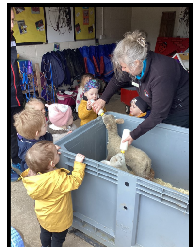
Feeding Nursery pet lambs.