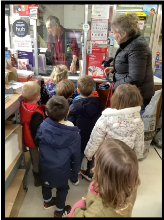
A visit to Ashleworth Post Office.