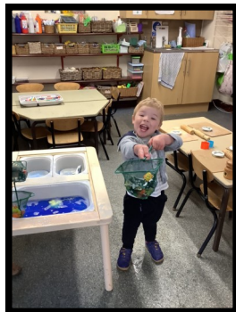
Look what I caught!