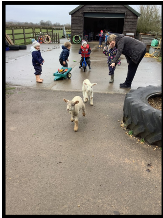
Snowy and Brownie, Nursery pet lambs.