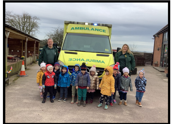
Ambulance and Paramedics