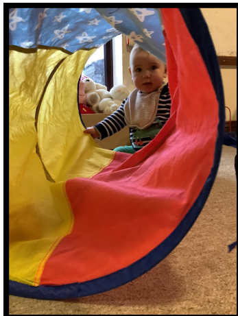
Peek a boo!