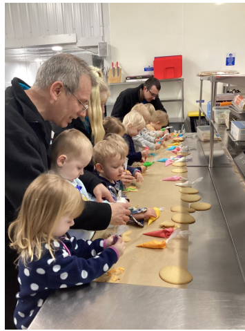
Hedgehogs decorating biscuits in a commercial kitchen